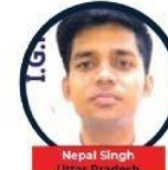
Nepal Singh Uttar Pradesh