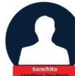
Sanchita Madhya Pradesh