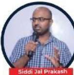
Siddi Jai Prakash Uttar Pradesh