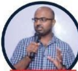
Siddi Jai Prakash Uttar Pradesh