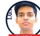
Nepal Singh Uttar Pradesh